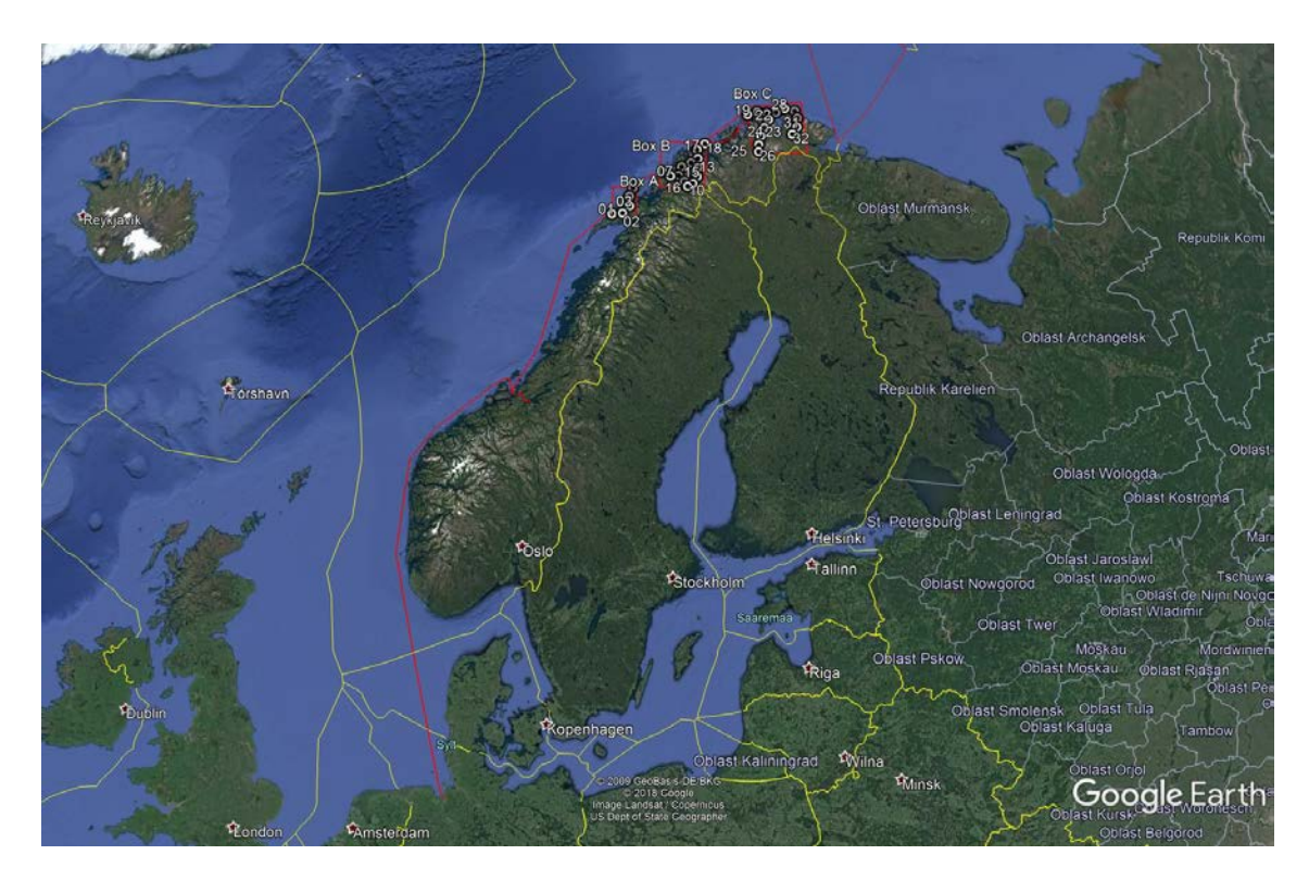
Chart of the geographical area of intented work marked with red boxes, including underway measurements. Prelimnary positions (see also Table 1) of water sampling stations are shown in red but final positions might be subject to sea-state and weather condition.